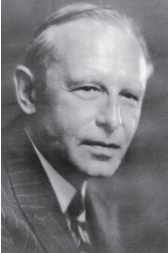
Figure 1.4 Karl Terzaghi (1883–1963)