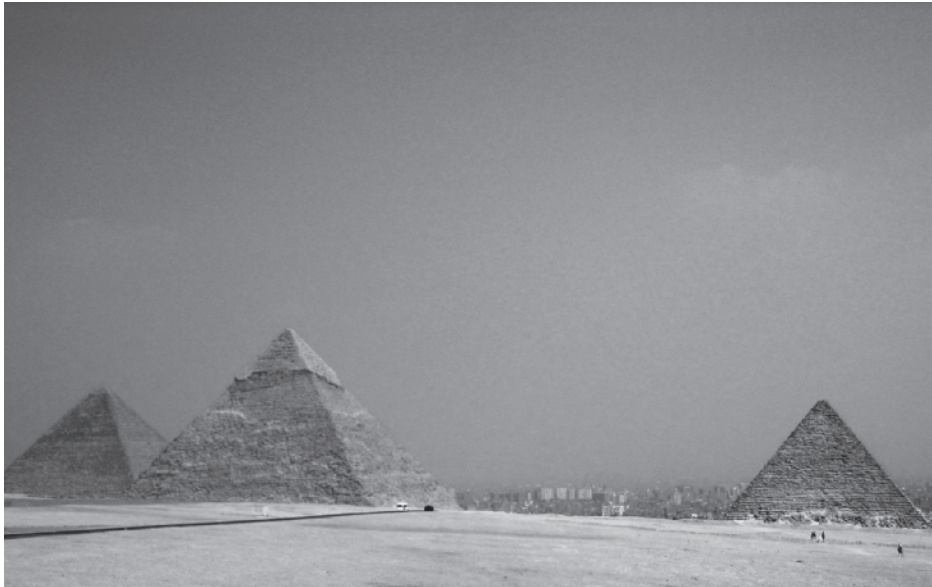
Figure 1.1 A view of the pyramids at Giza.

Pakistan after 1947). During the Chan dynasty in China (1120 B.C. to 249 B.C.) many dykes were built for irrigation purposes. There is no evidence that measures were taken to stabilize the foundations or check erosion caused by floods (Kerisel, 1985). Ancient Greek civilization used isolated pad footings and strip-and-raft foundations for building structures. Beginning around 2700 B.C., several pyramids were built in Egypt, most of which were built as tombs for the country's Pharaohs and their consorts during the Old and Middle Kingdom periods. Table 1.1 lists some of the major pyramids identified through the Pharaoh who ordered it built. As of 2008, a total of 138 pyramids have been discovered in Egypt. Figure 1.1 shows a view of the pyramids at Giza. The construction of the pyramids posed formidable challenges regarding foundations, stability of slopes,