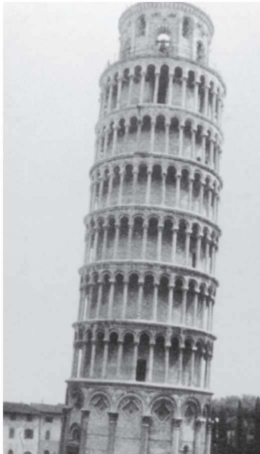
Figure 1.2 Leaning Tower of Pisa, Italy

One of the most famous examples of problems related to soil-bearing capacity in the construction of structures prior to the 18th century is the Leaning Tower of Pisa in Italy (See Figure 1.2). Construction of the tower began in 1173 A.D. when the Republic of Pisa was flourishing and continued in various stages for over 200 years. The structure weighs about 15,700 metric tons and is supported by a circular base having a diameter of 20 m. The tower has tilted in the past to the east, north, west, and, finally, to the south. Recent investigations showed that a weak clay layer existed at a depth of about 11 m below the ground surface compression of which caused the tower to tilt. It became more than 5 m out of plumb with the 54 m height. The tower was closed in 1990 because it was